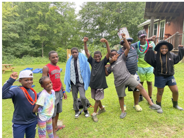
9 of our youth enjoyed a week at Camp Wightman in Griswold, CT the week of August 11. The weather was perfect and the kids agreed that it was a great week. They are ready to go back next year. Thank you to everyone who provided money and/or supplies to make the week successful.